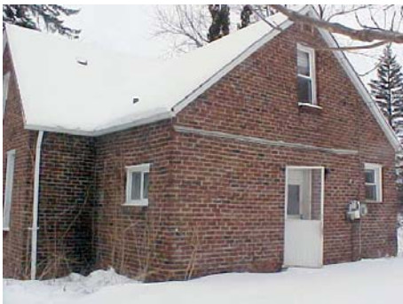
Good solid brick work

Prices are springing up from the absurdly low levels as local investors buy up such property, there are even bidding wars on many repossessions. Prices are now sharply on the up. There is no previous sale history for this property in the last 5 years but the current valuation is 127,000 USD . The NET return is just below 14% which is an excellent return, not to mention the huge capital gains to be experienced as the market rebounds.