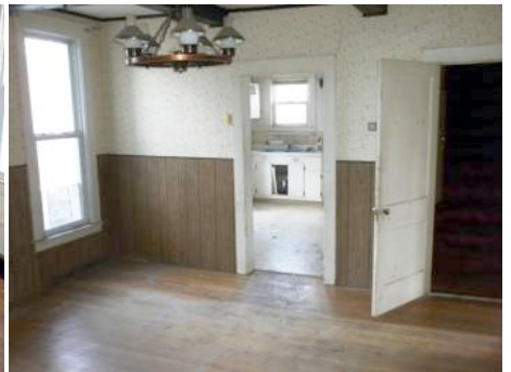
Dining Room leading to Kitchen