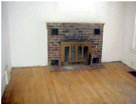
Living room – real fire