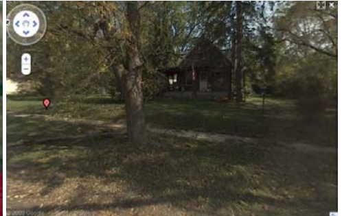
Google image – front and plot