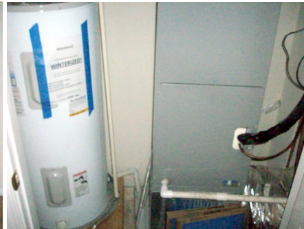
Boiler and Air Con System